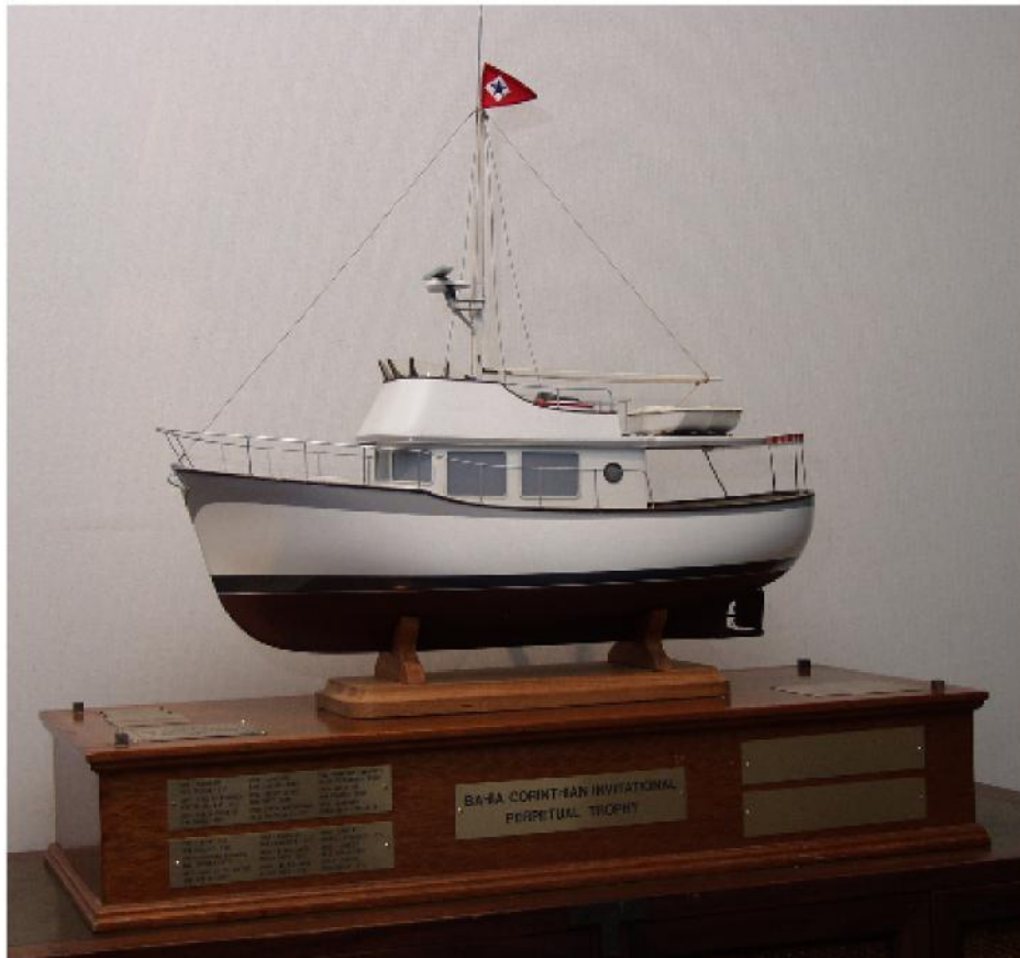
Bahia Corinthian Yacht Club Invitational Trophy