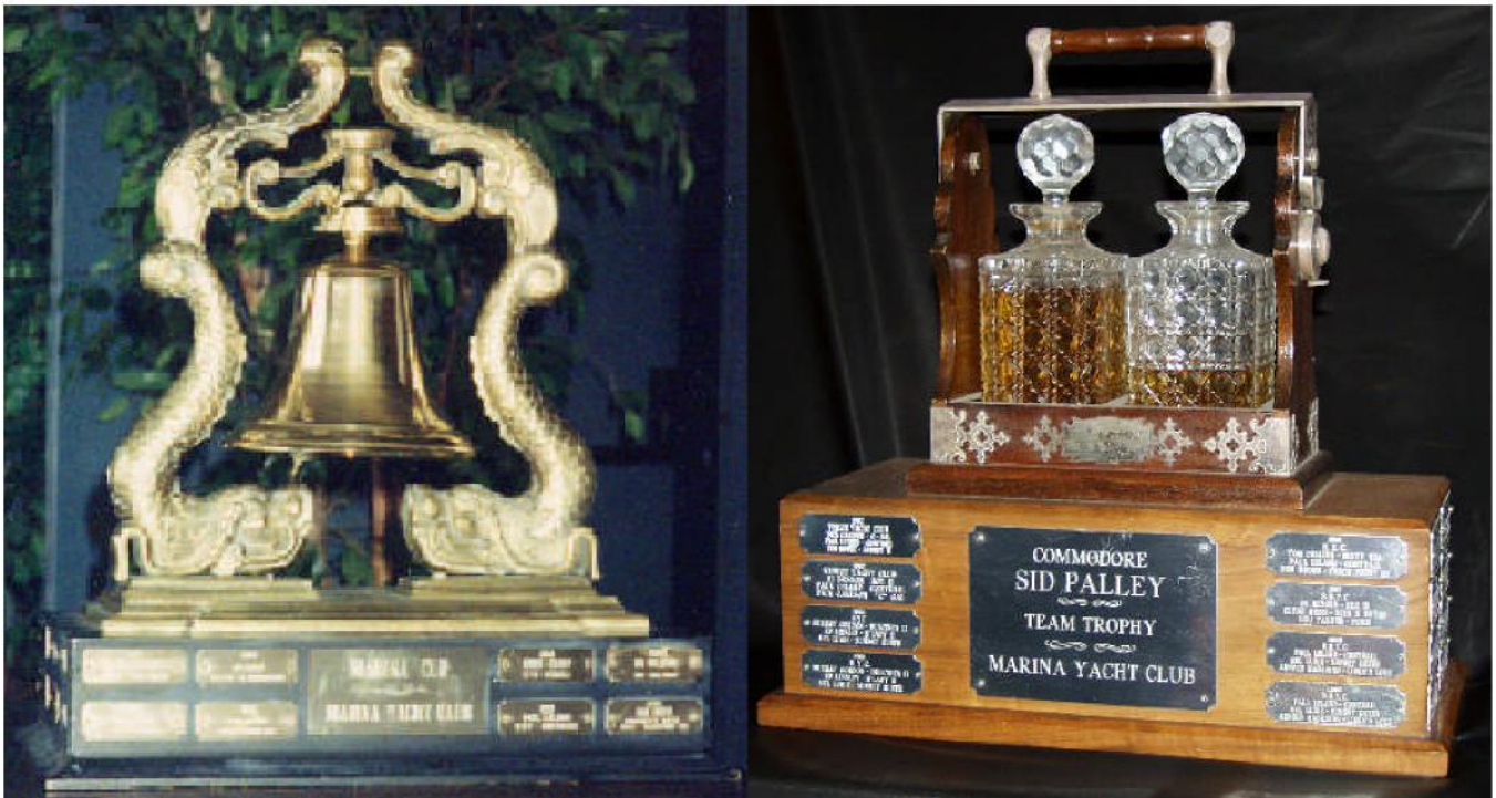
MARINA CUP TROPHY