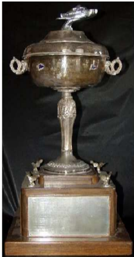
SHARKIE PERPETUAL TROPHY