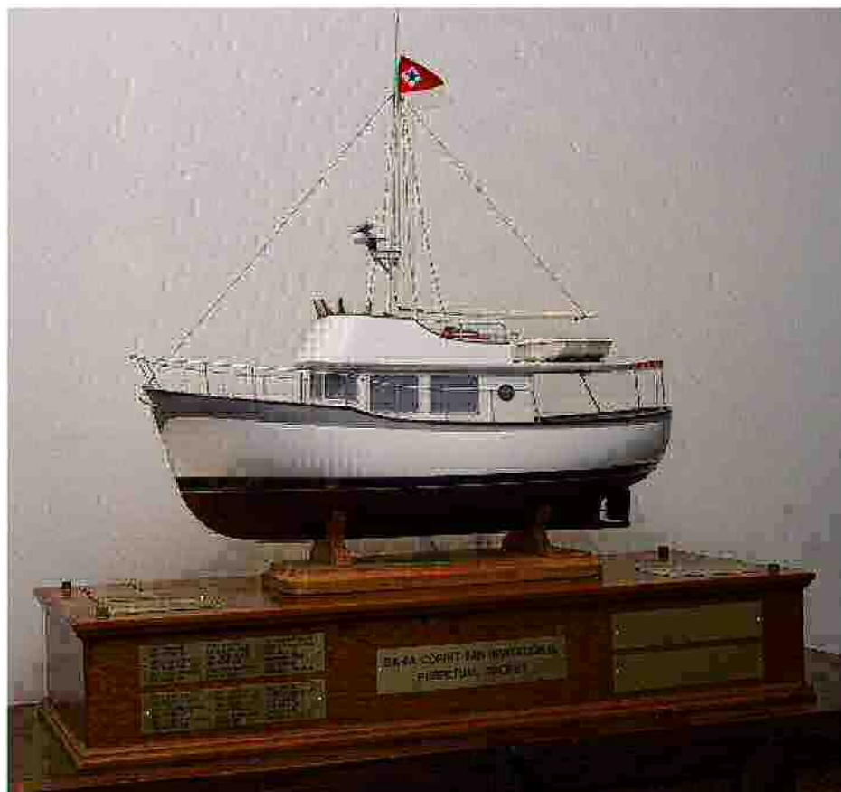
Bahia Corinthian Yacht Club Invitational Trophy