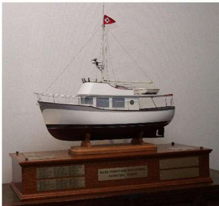
Bahia Corinthian Yacht Club Invitational Trophy