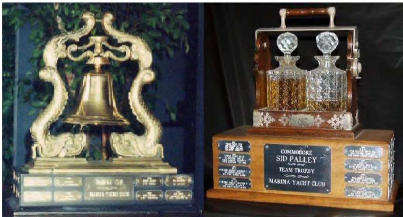
MARINA CUP TROPHY