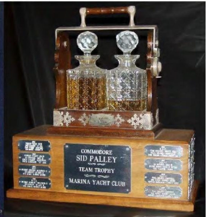
SID PALLEY TEAM TROPHY